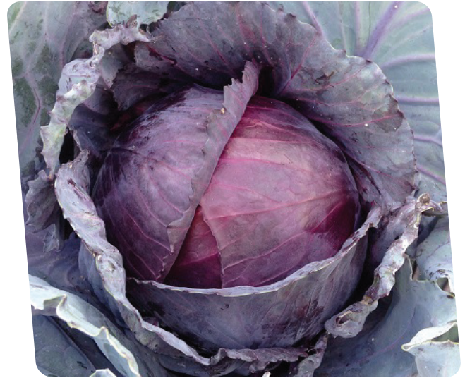
RED BALL F1