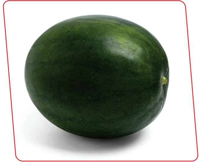
HS 3125 F1