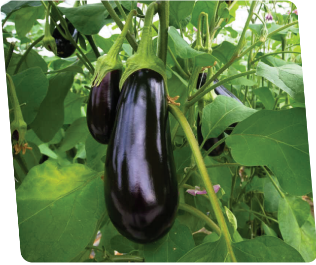
E 215 F1