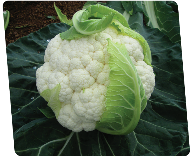
WHITE ROSE F1