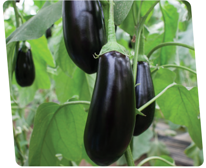
E 216 F1